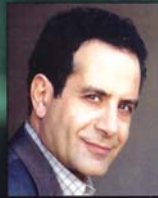
Narrated by Tony Shalhoub

A half-hour program that delivers eco-living basics to your door